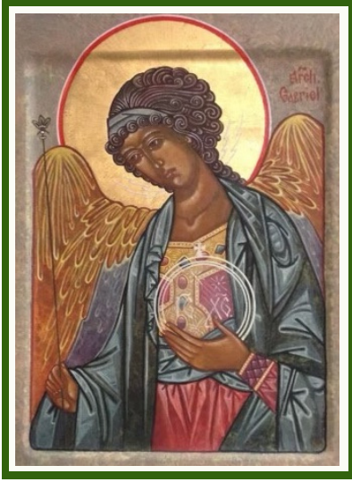
BEGINNER ICON* Archangel Gabriel