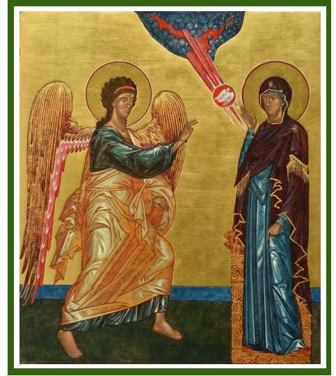
INTERMEDIATE ICON The Annunciation